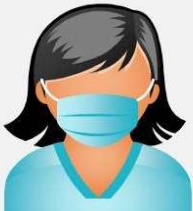
Health Care Assistant

First point of contact the reception team are trained and trusted to offer you the most appropriate service or professional to help you. They may have to ask you for more information in order to do so.