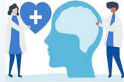
Mental Health Nurse

As well as administering injections, providing wound care delivering childhood immunisations, Practice nurses are qualified in a range of specialities including diabetes management, respiratory conditions & women's health.